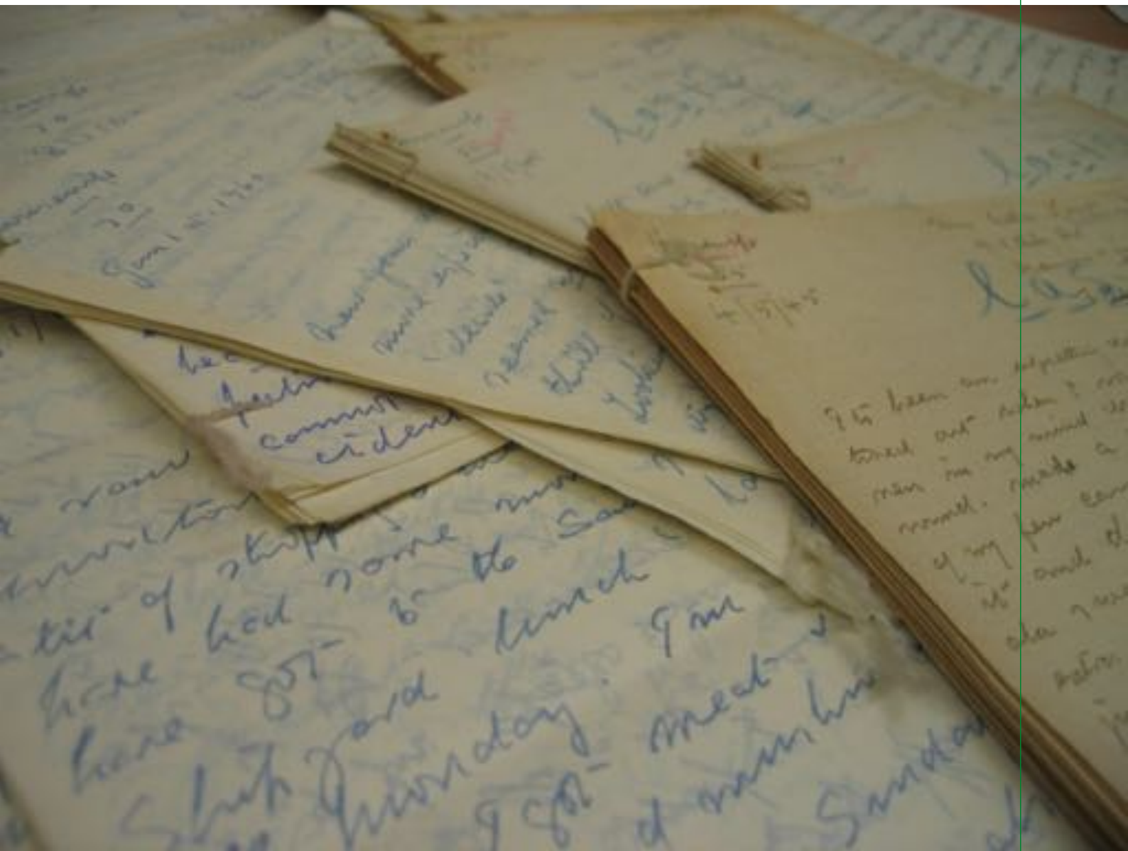
Mass Observation Archive