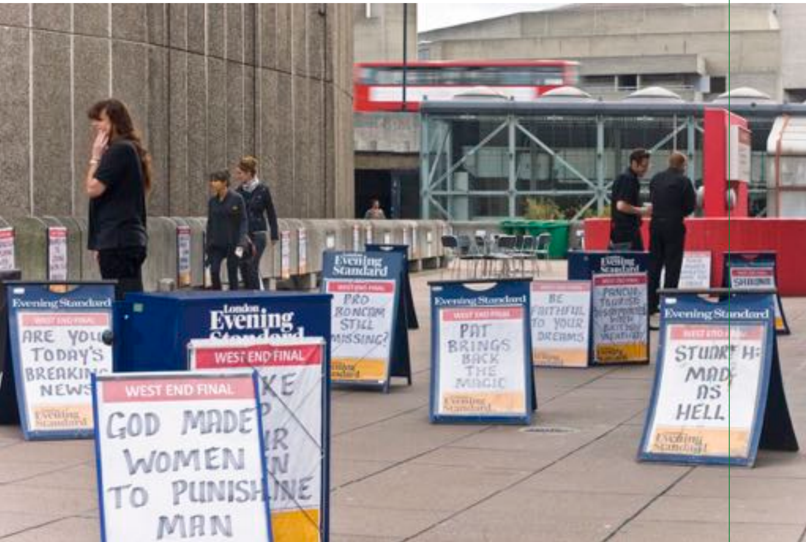
Extra! Extra! by Jeremy Hutchinson