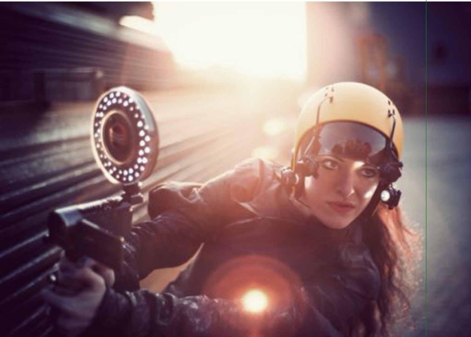
I'd Hide You by Blast Theory